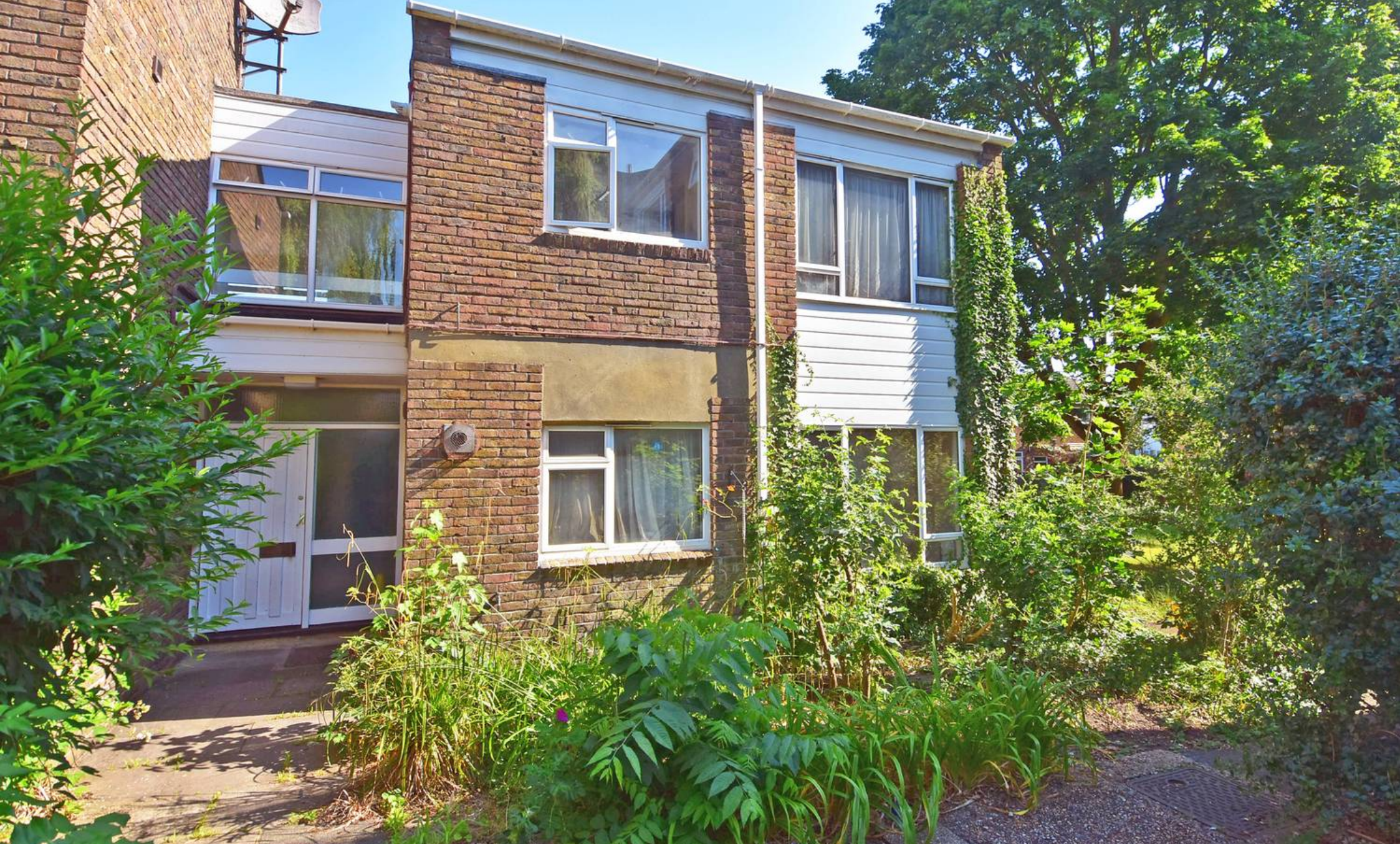
15 Beard Road, Kingston Upon Thames £270,000