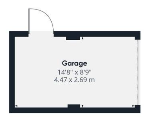
Floor 1 Building 2