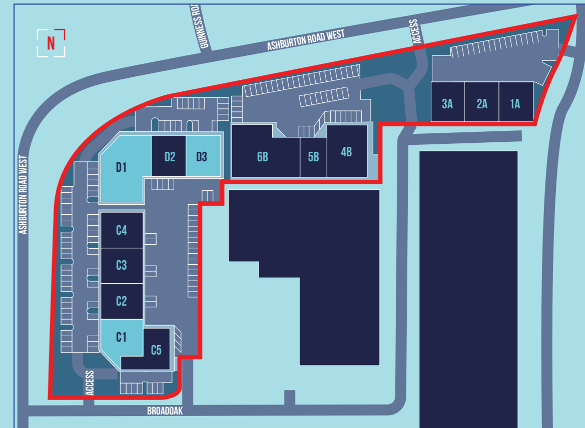
**PLAN NOT TO SCALE