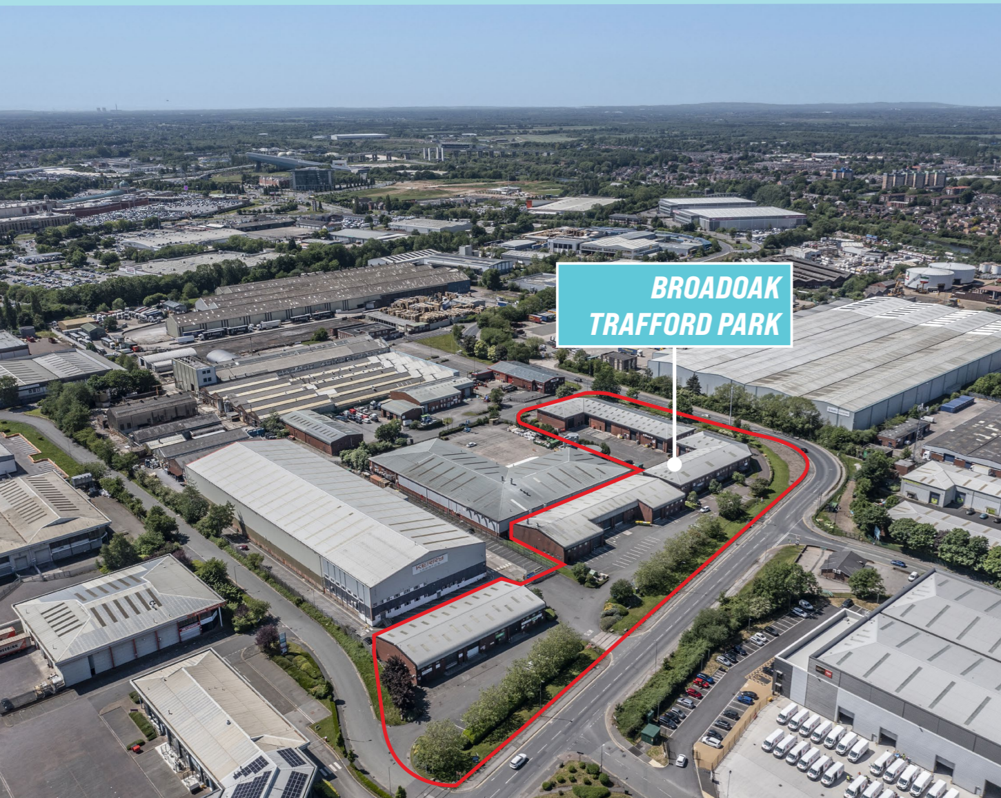
BROADOAK TRAFFORD PARK

The generic specification is a concrete floored warehouse area with two storey offices. Some units have a higher office content than others. The well-presented estate has established landscaping areas and excellent main road prominence.