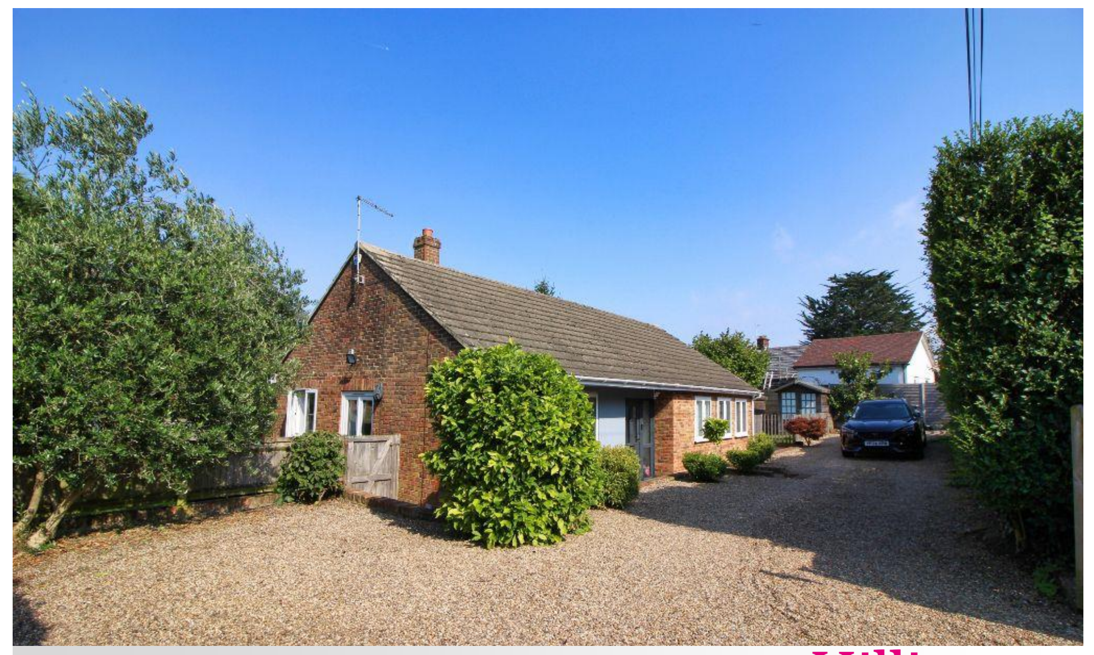
201 FAIRFIELD ROAD, BOROUGH GREEN, KENT, TN15 8DU