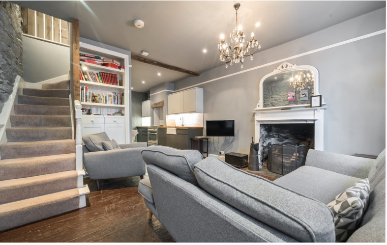
Open Plan Sitting Room