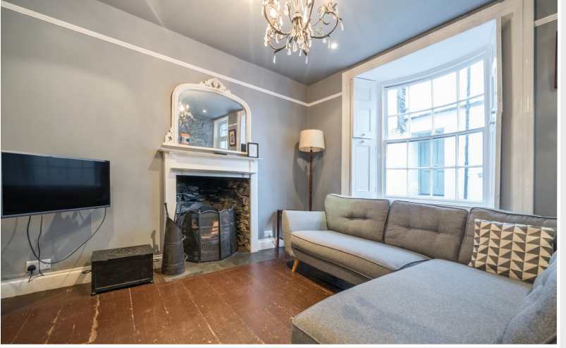
Open Plan Sitting Room