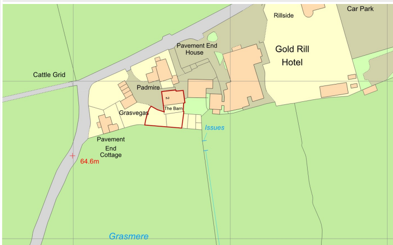
Ordnance Survey Map