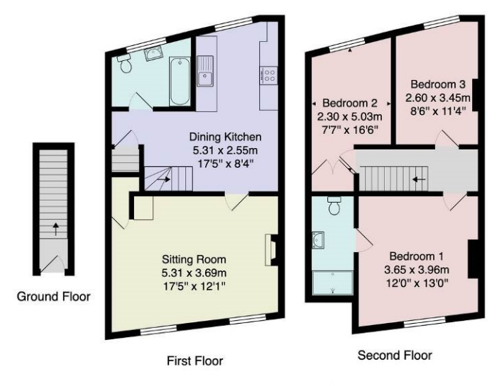
Total Area: 89.7 m² ... 965 ft² All measurements are approximate and for display purposes only. No liability is accepted by either the agency or Box Property Solutions Ltd as to the exact measurements of the rooms.