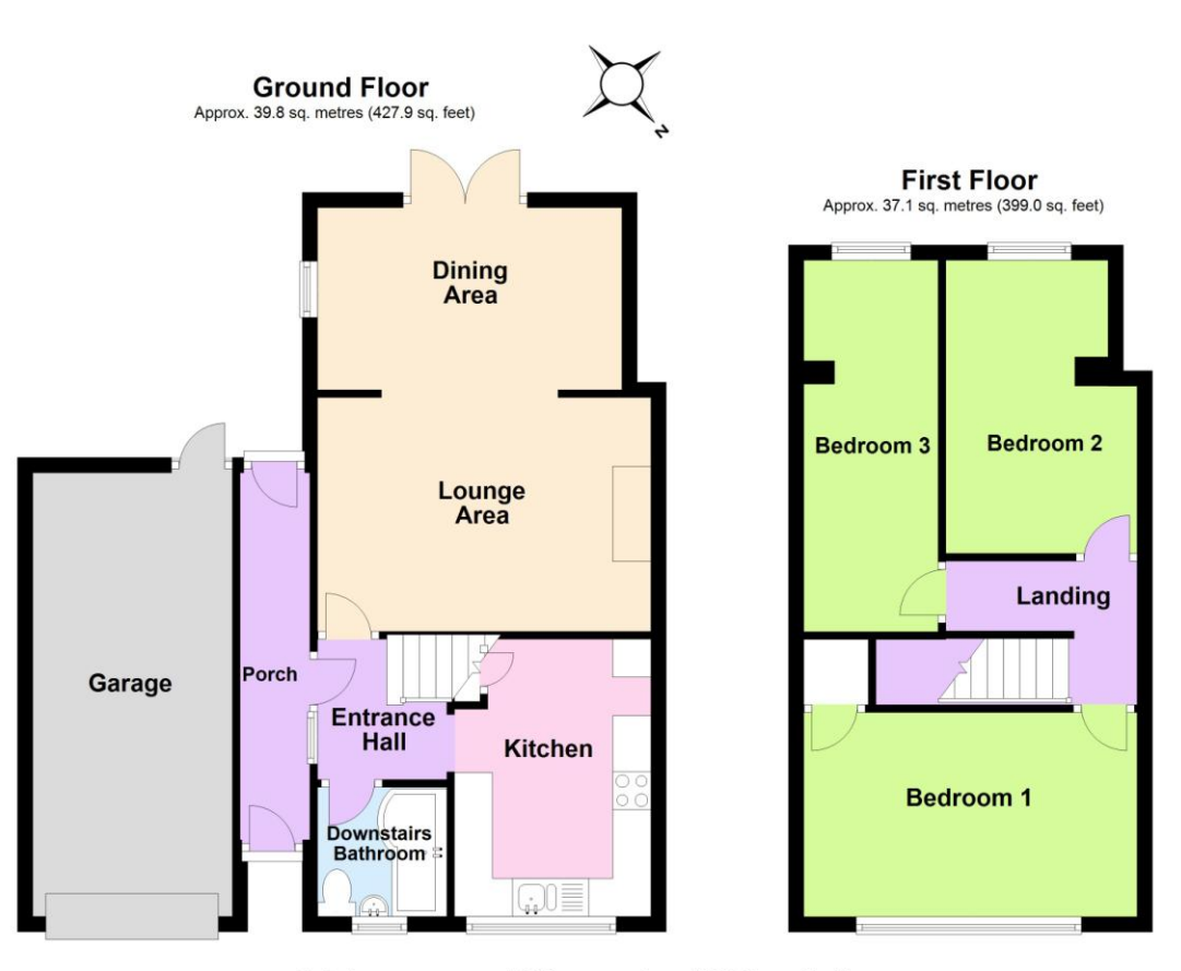
Total area: approx. 76.8 sq. metres (826.9 sq. feet)