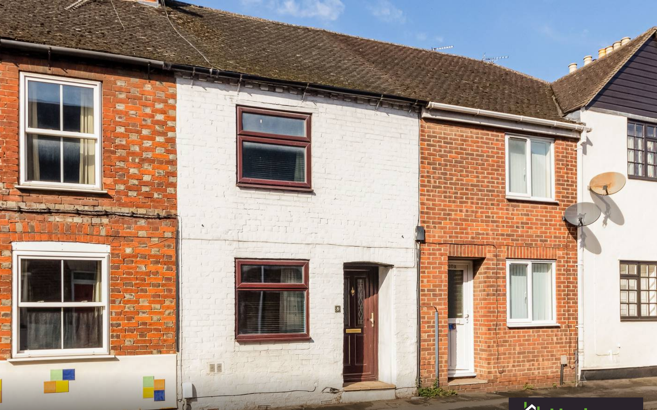
8 Spring Road, Abingdon OX14 1AQ