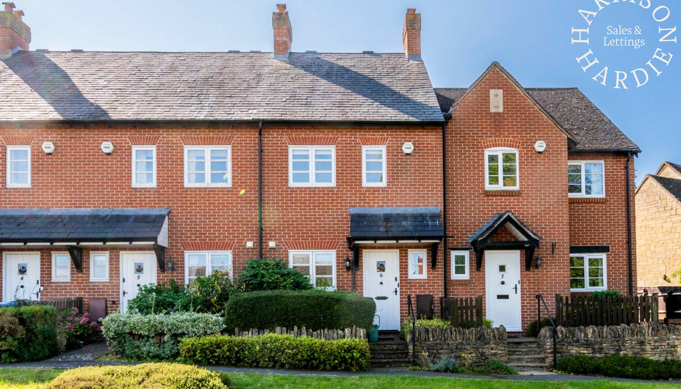
The Green, Stretton On Fosse