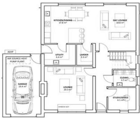
PLOT 2 GROUND FLOOR PLAN Scale: 1:100