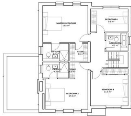
PLOT 2 FIRST FLOOR PLAN Scale: 1:100

PLOT 2 AREAS GROUND FLOOR = 112.60m 2 FIRST FLOOR = 9.3m 2 TOTAL = 205.6m 2