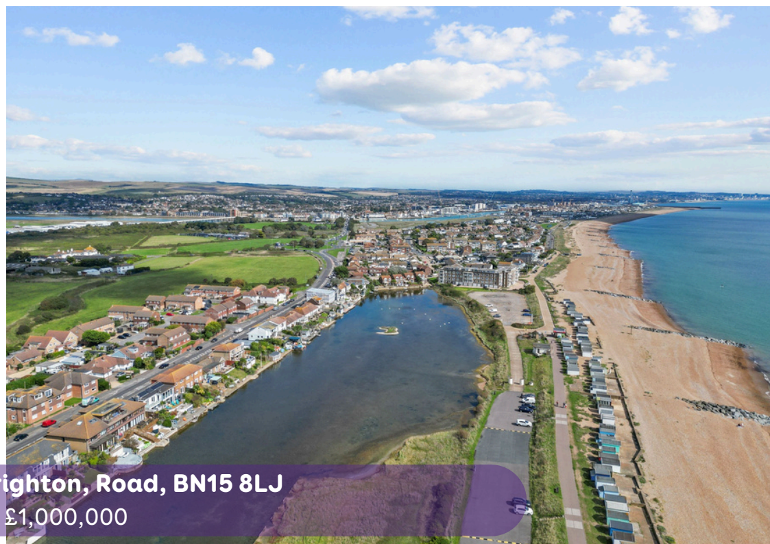
Widewater Lagoon, Brighton, Road, BN15 8LJ Offers Over £1,000,000