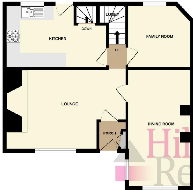
GROUND FLOOR 54.0 sq.m. (581 sq.ft.) approx.