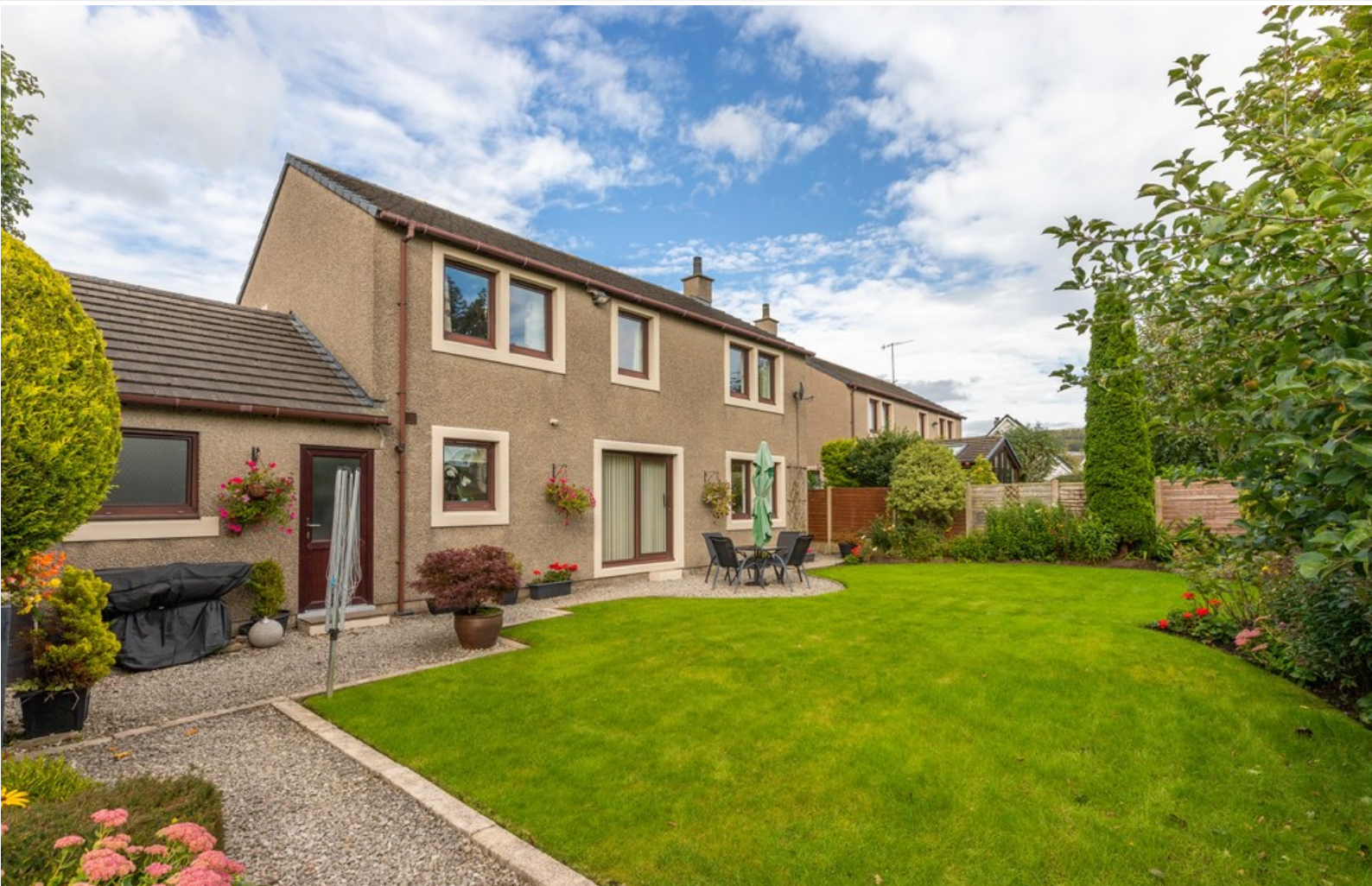
Rear Elevation and Garden

Request a Viewing Online or Call 01539 729711