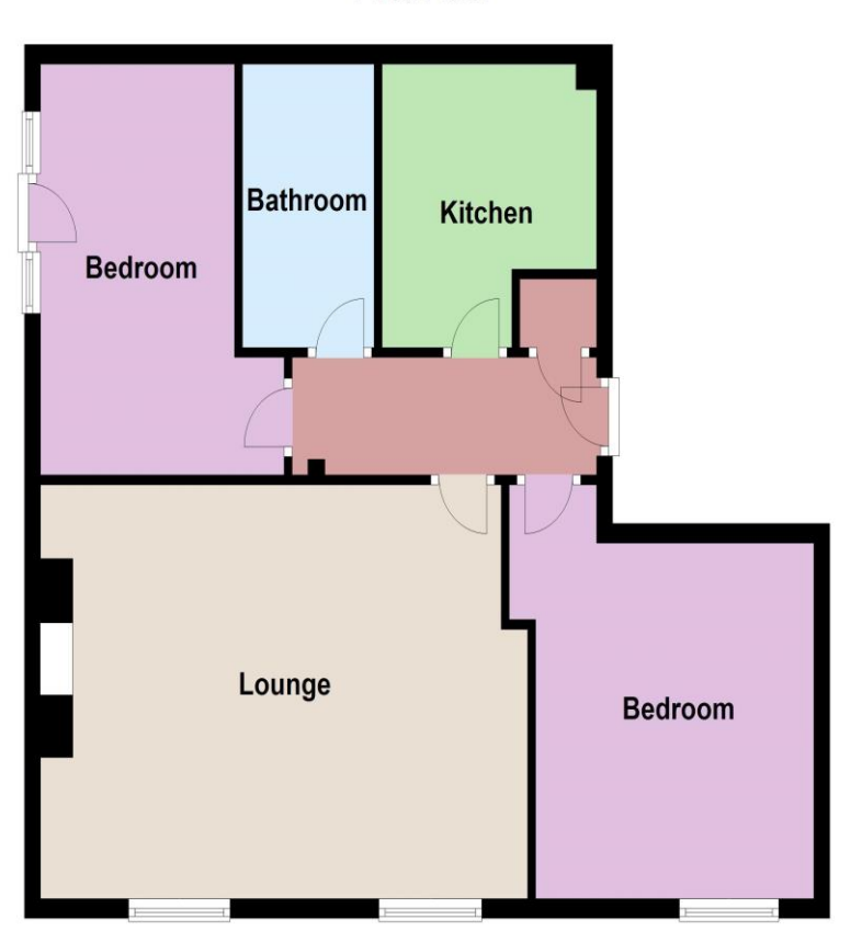
Copyright Oakwood homes - Not to be reproduced or copied without permission. All rights reserved. Plan produced using PlanUp.