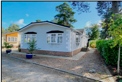
Pitch Fee: approx £801.48 per quarter Subject to Annual Review Council Tax Band: 'A' Tenure: 1