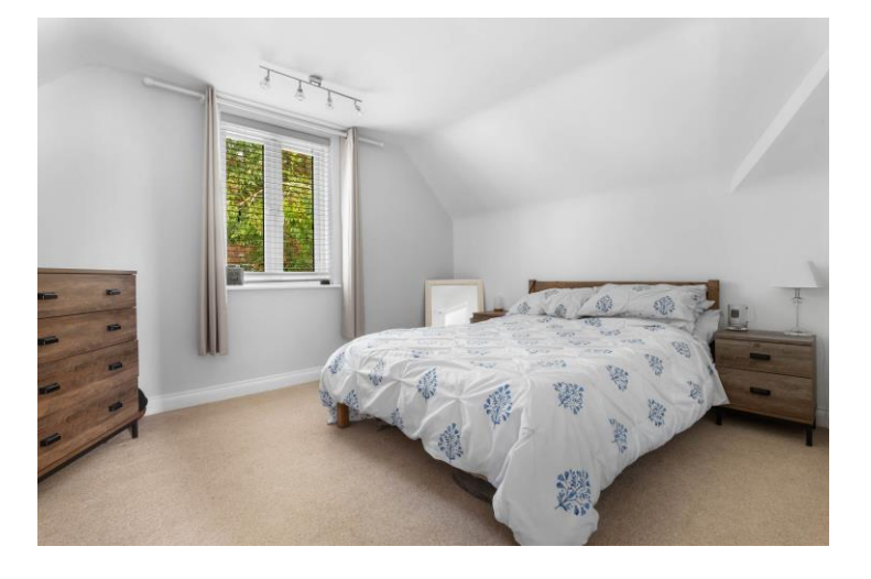
Bedroom Three 3.83m (12'7") x 2.94m (9'8")