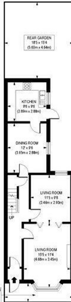
GROUND FLOOR GROSS INTERNAL FLOOR AREA 609 SQ FT