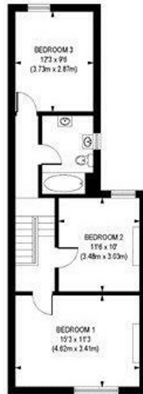
FIRST FLOOR GROSS INTERNAL FLOOR AREA 570 SQ FT