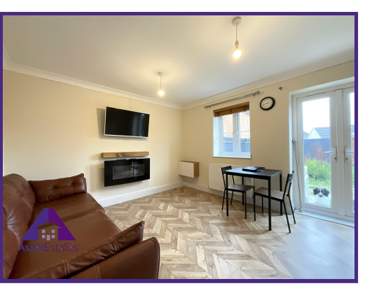
Larch Lane, Tredegar, NP22 4FA