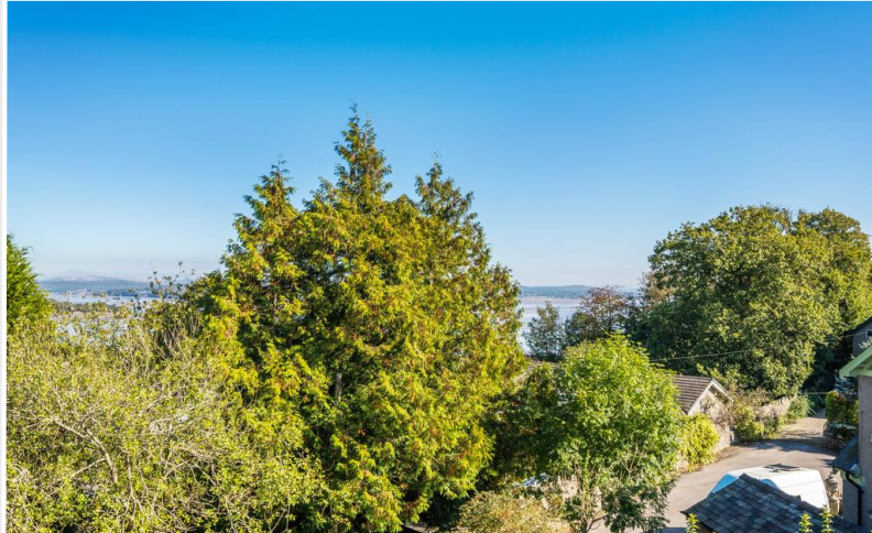
View from Second Floor towards Morecambe Bay