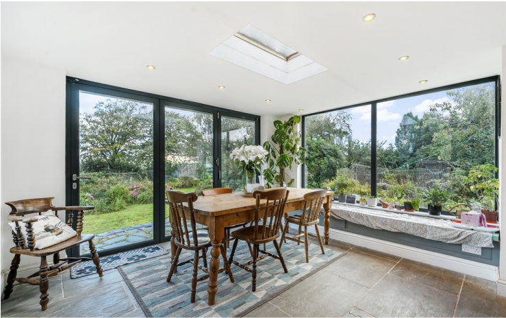
Family Dining Kitchen