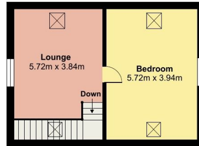
ANNEX FIRST FLOOR