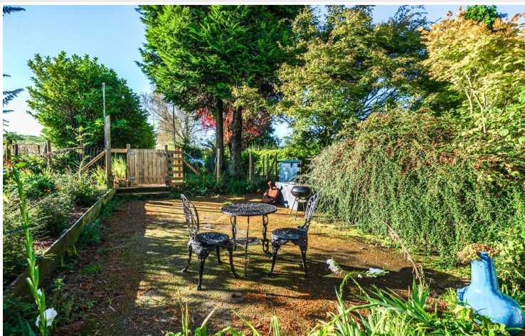
Pinethwaite Studios Garden

Services: The property benefits from a free water supply sourced from a nearby tarn, shared with six other households. There is no mains gas, with the hob powered by bottled gas, while the central heating is oil-fired, with the oil tank located at the front of the property near the gate.