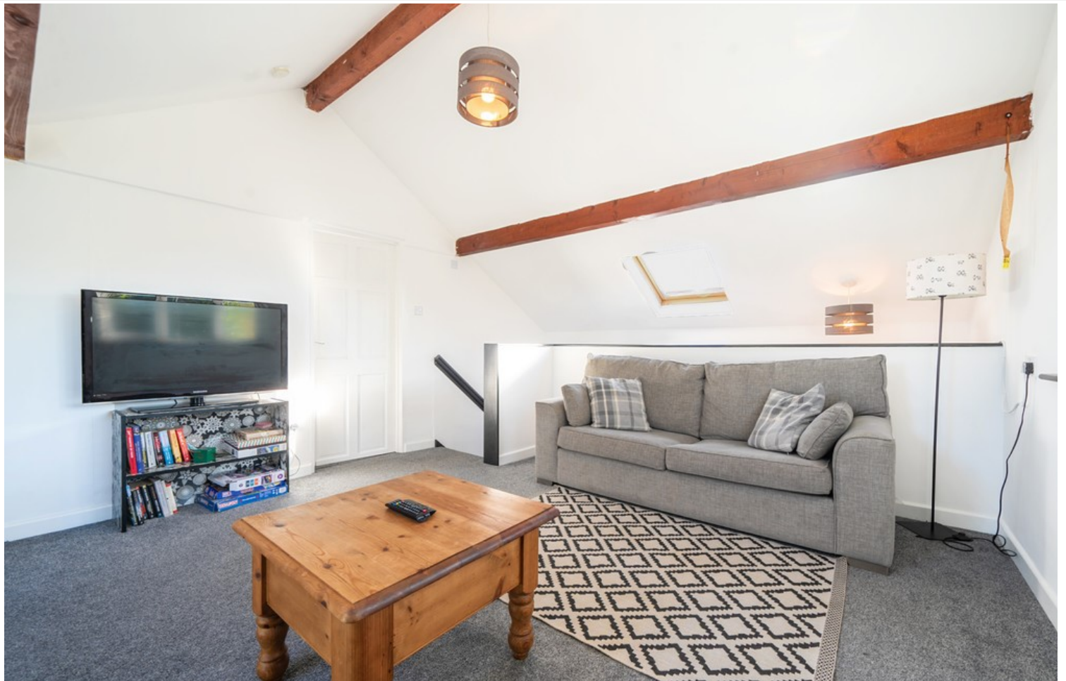
Pinethwaite Studio Lounge