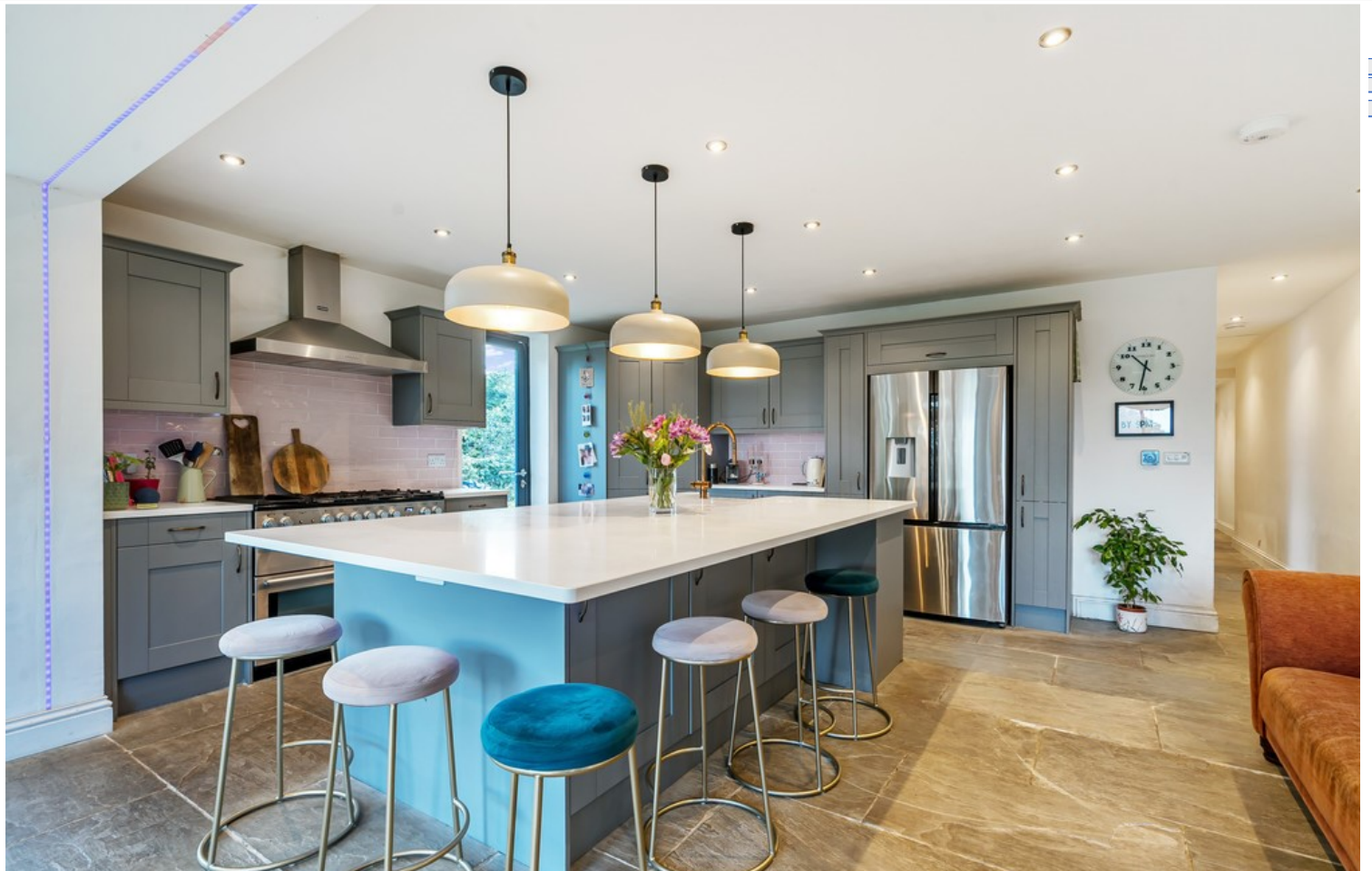
Family Dining Kitchen