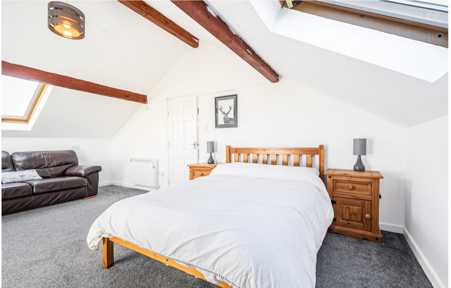
Pinethawaite Studio Bedroom