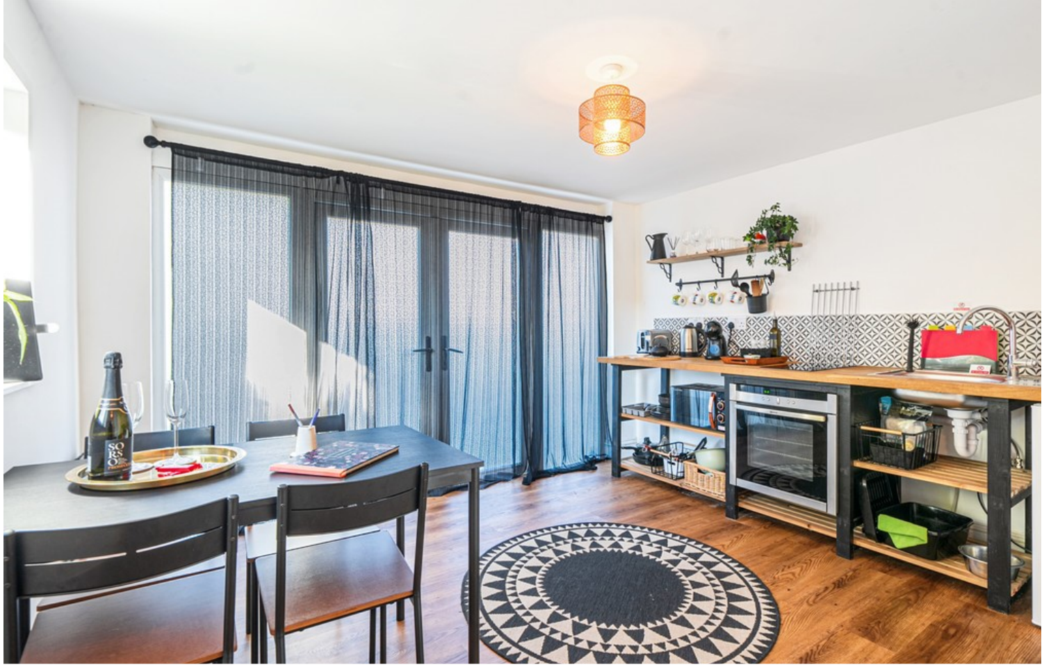
Pinethwaite Studio Kitchen / Dining Room