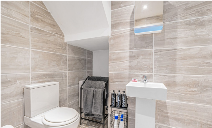
Pinethwaite Studios Shower Room