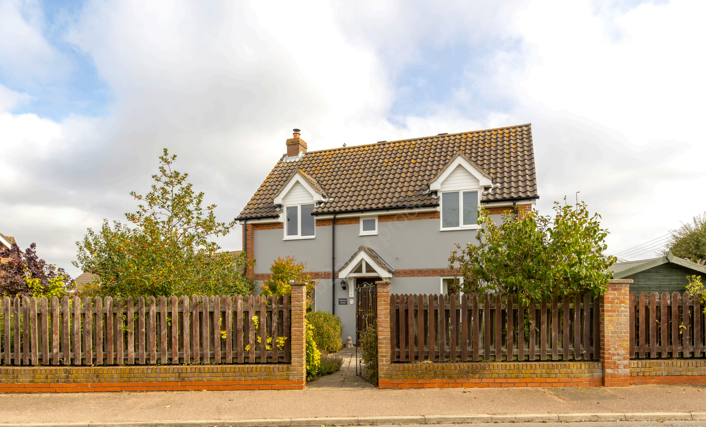
2 GORSE VIEW WESTLETON, HALESWORTH, IP17 3BW