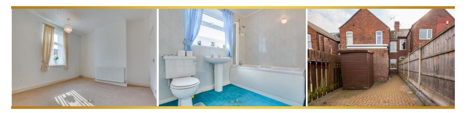
GROUND FLOOR 49.44 sq. m. (532.13 sq. ft.)