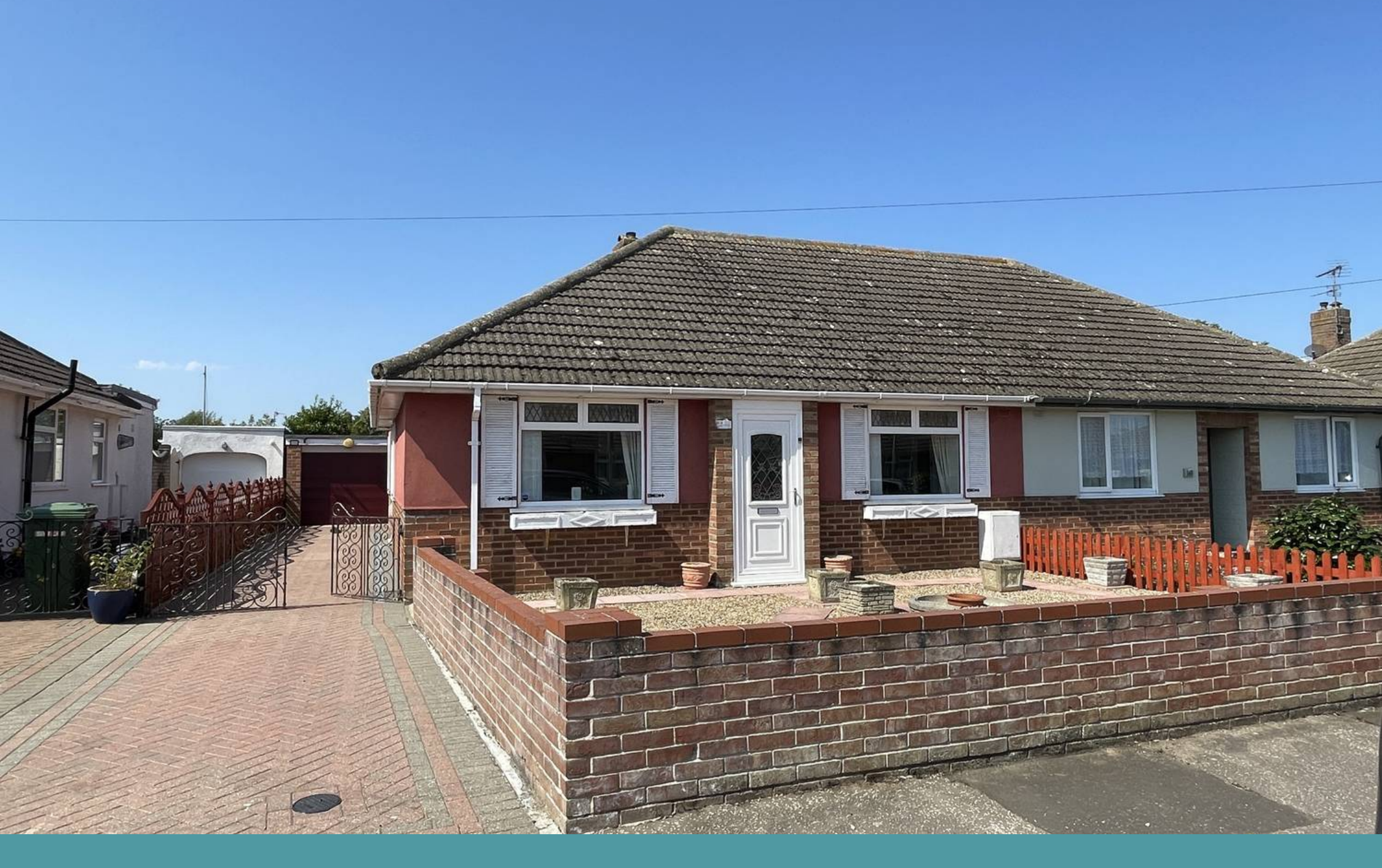
12 Westland Road, Lowestoft