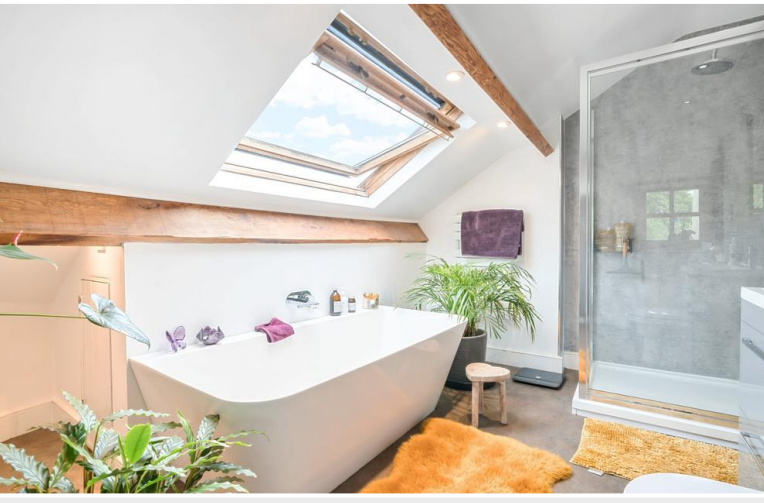
En-Suite Bathroom to Bedroom 1

Both rooms on this floor are currently utilised as incredibly spacious and light 'his and her' Home Offices - so much more that the average Home Office! Very light and airy and we imagine inspiring places to work! Needless to say there are more exposed beams and floorboards and both of these versatile rooms could be whatever your family requires.