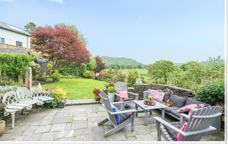
Patio and Garden

Rental Potential: If you were to purchase this property for residential lettings we estimate it has the potential to achieve £1400 - £1500 per calendar month. For further information and our terms and conditions please contact our Grange Office.