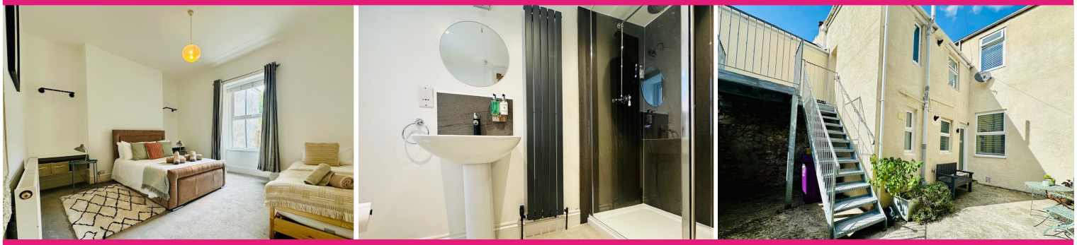
GROUND FLOOR 616 sq.ft. (57.3 sq.m.) approx.