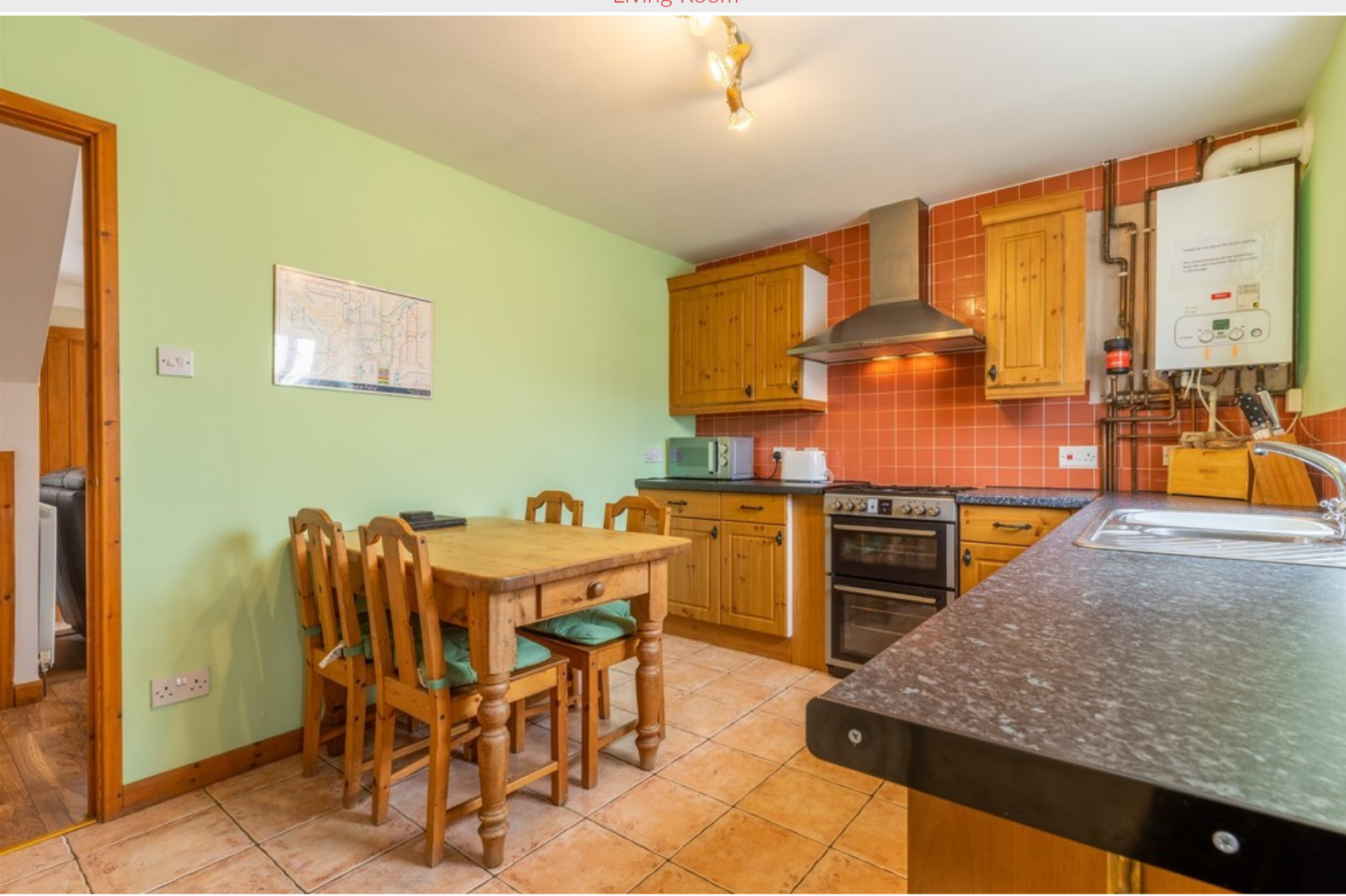
Kitchen / Diner