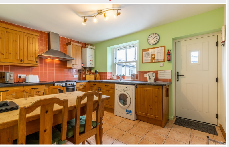
Kitchen / Diner