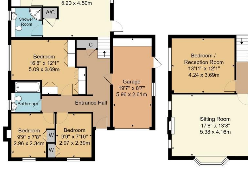
Ground Floor / Upper Ground Floor