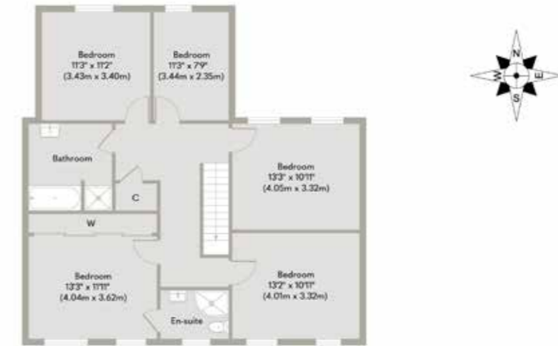
First Floor Approximate Floor Area 971 sq. ft (90.23 sq. m)