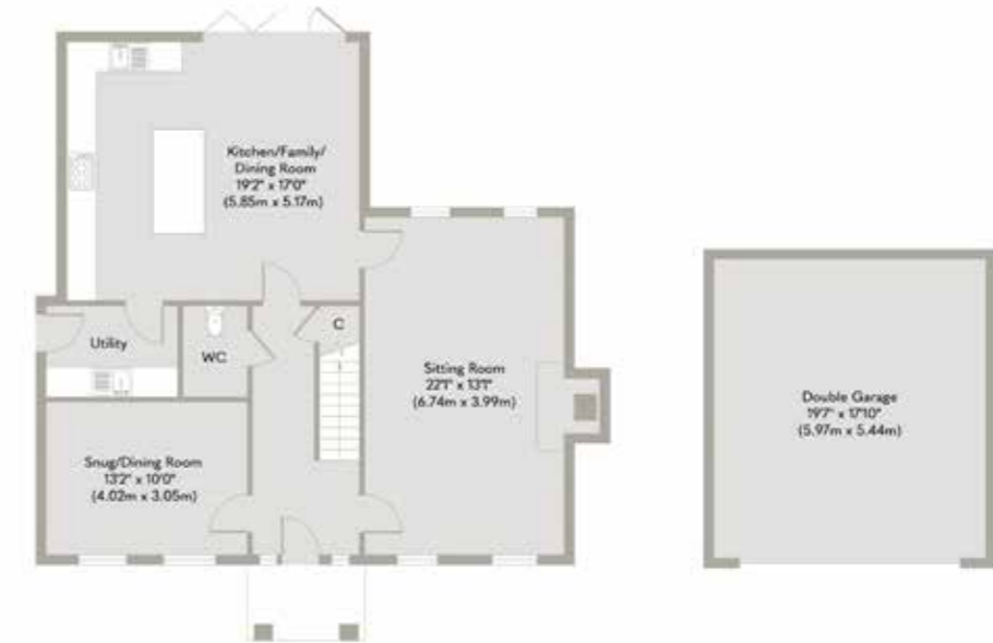
Ground Floor Approximate Floor Area 972 sq. ft (90.28 sq. m)