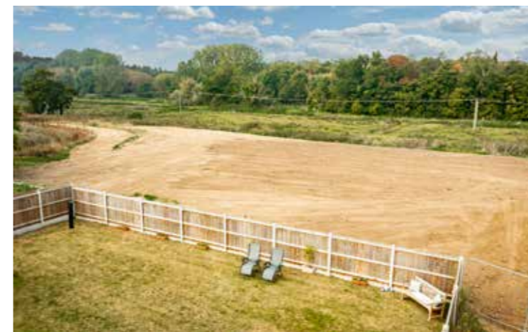
Area behind 14 Chestnut Drive, which has plans to be landscaped into an open communal space.

“The lovely country surroundings helps create our own little sanctuary.”