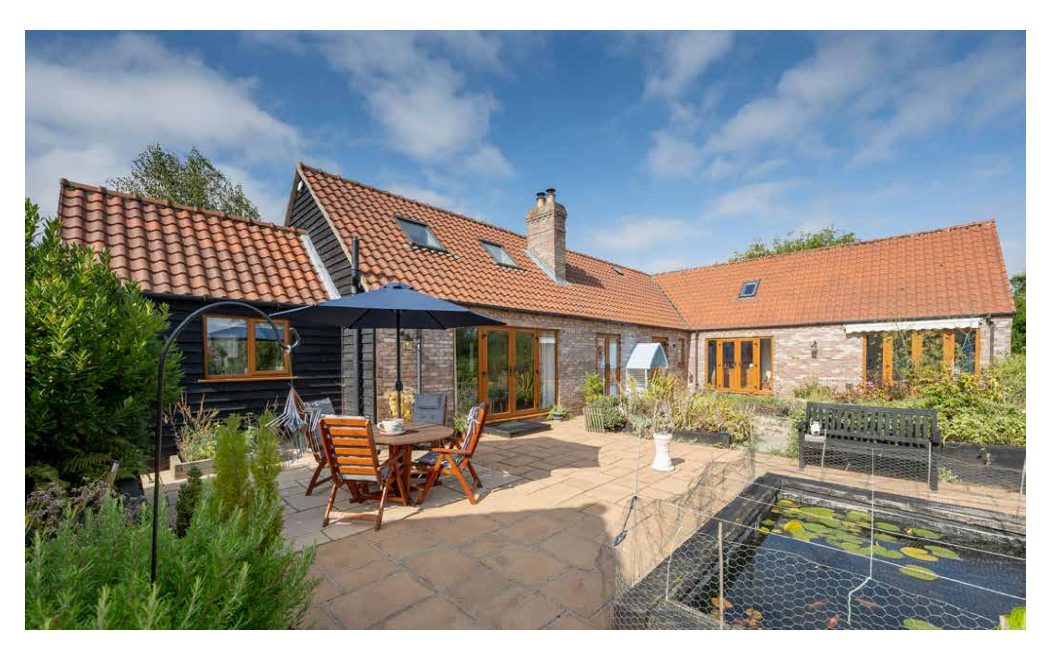
The Keepers Church Lane | Tydd St. Giles | Cambridgeshire | PE13 5LG