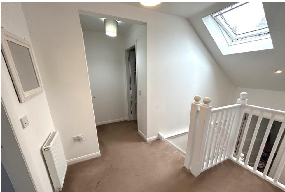
Next Home - 21 Milnab Street, Crieff, PH7 4BH