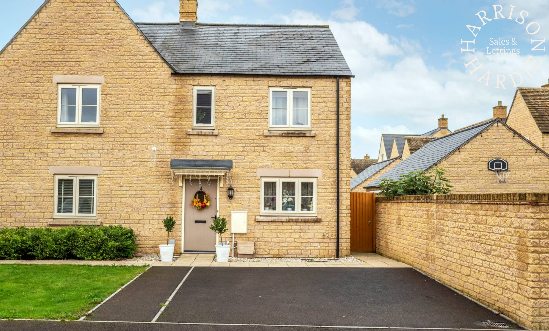
Heron Close, Bourton-On-The-Water