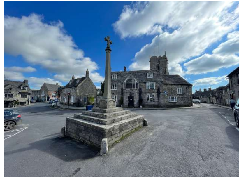
Village Square and Castle Ruins