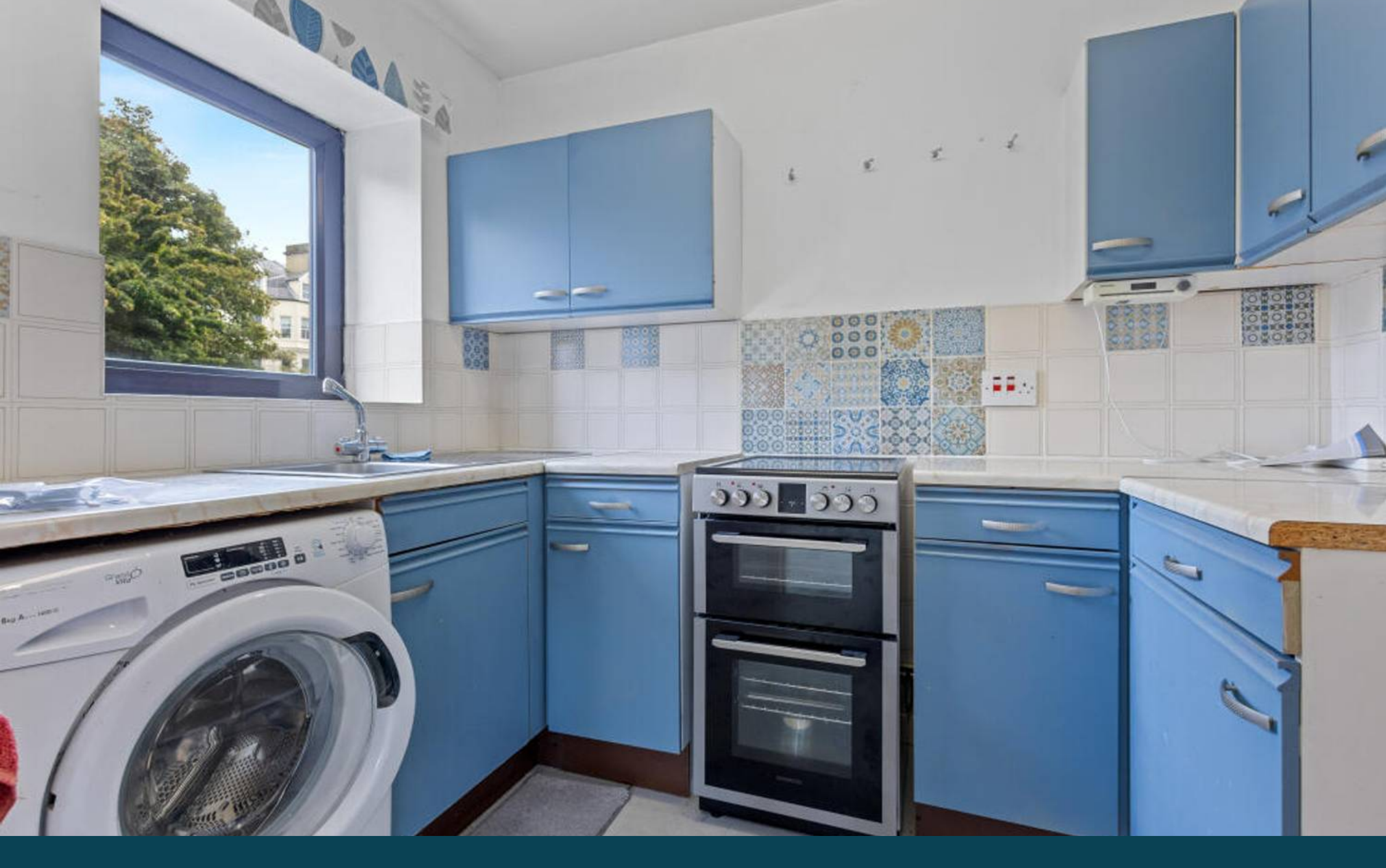
11 Court Place Castle Hill Avenue, Folkestone Guide Price £85,000