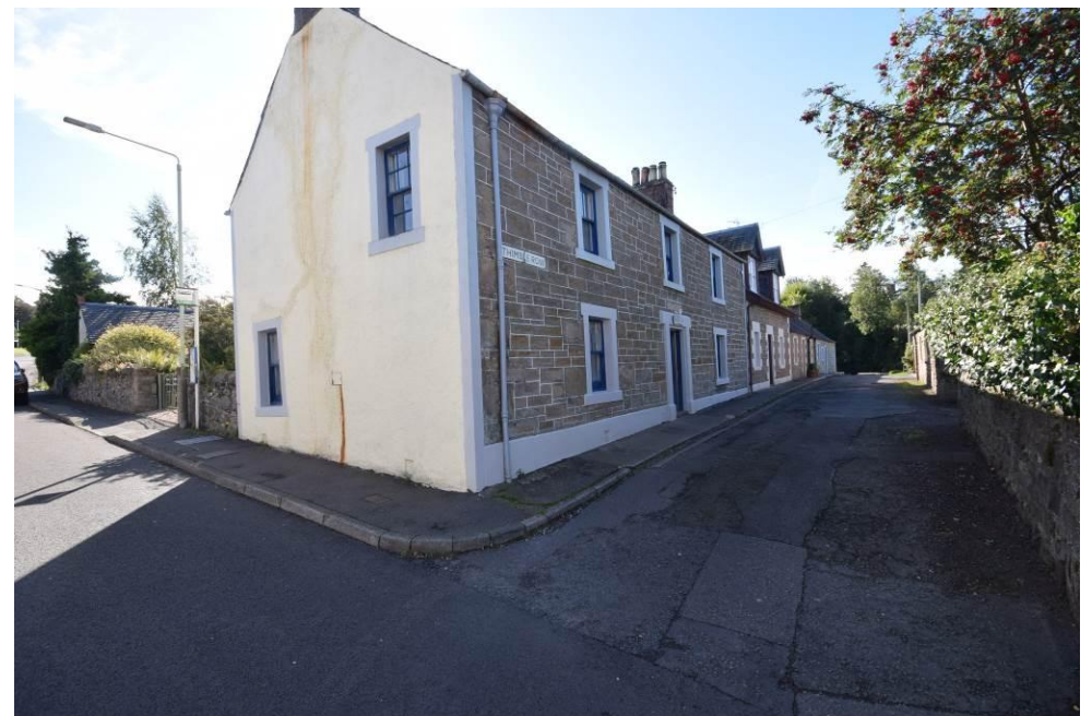
Next Home - Rowanbank, Thimblerow, Dunning, Perth, PH2 0RT