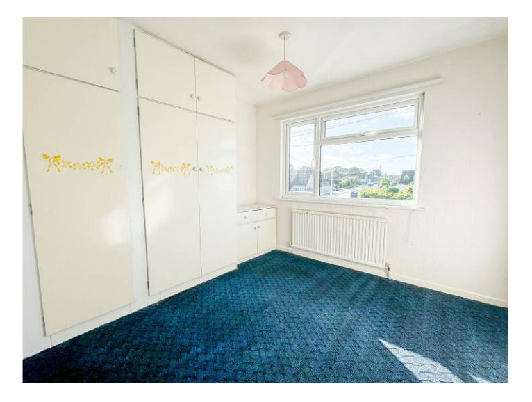
BEDROOM THREE 9' 6'' x 8' 6'' (2.9m x 2.59m) Double glazed window to the front aspect. Radiator.