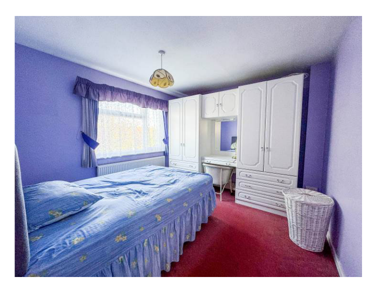
BEDROOM TWO 9' 6'' x 8' (2.9m x 2.44m) Double glazed window to the front aspect. Built-in wardrobes and storage unit. Radiator.