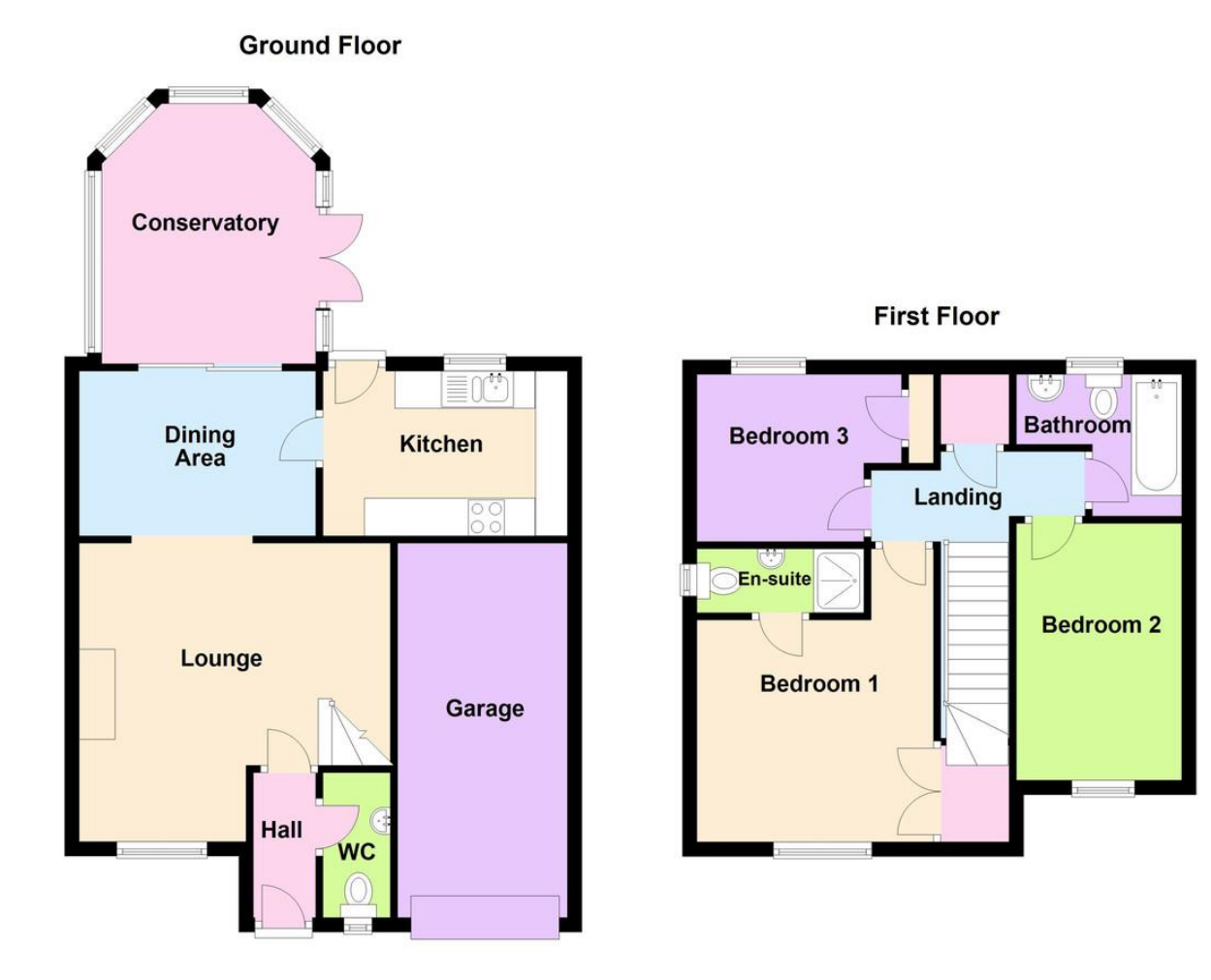
Floor plans are to show layout only and not drawn to scale.

MONEY LAUNDERING REGULATIONS: Under the Money Laundering Rules 2007, The Proceeds of Crime Act 2002 and The Terrorism Act 2000 the Agent is legally obliged to verify the identity of the Client through sight of legally recognised photographic identification (e.g. passport, photographic drivers licence) and documentary proof of address