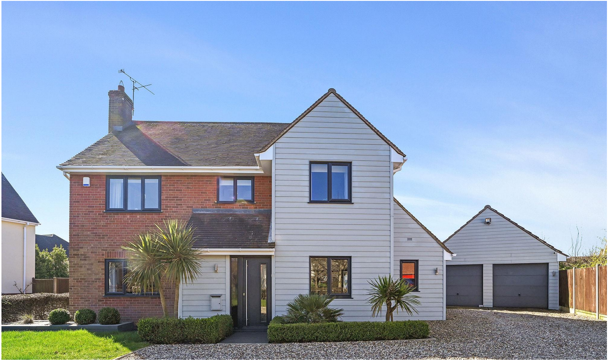
Pyefleet View Langenhoe, Colchester, Essex, CO5 7LD