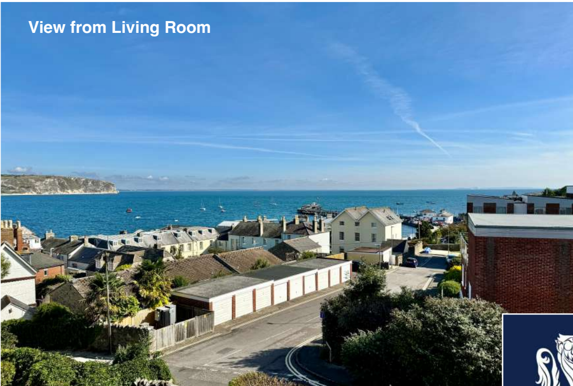
View from Living Room