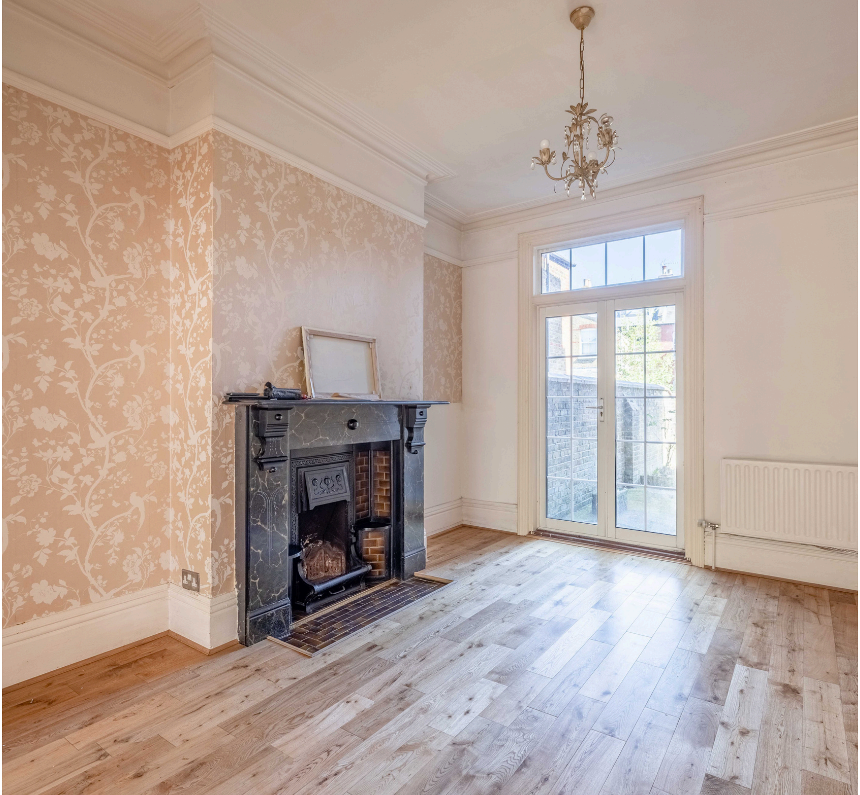
1A QUEENS ROAD, WINDSOR