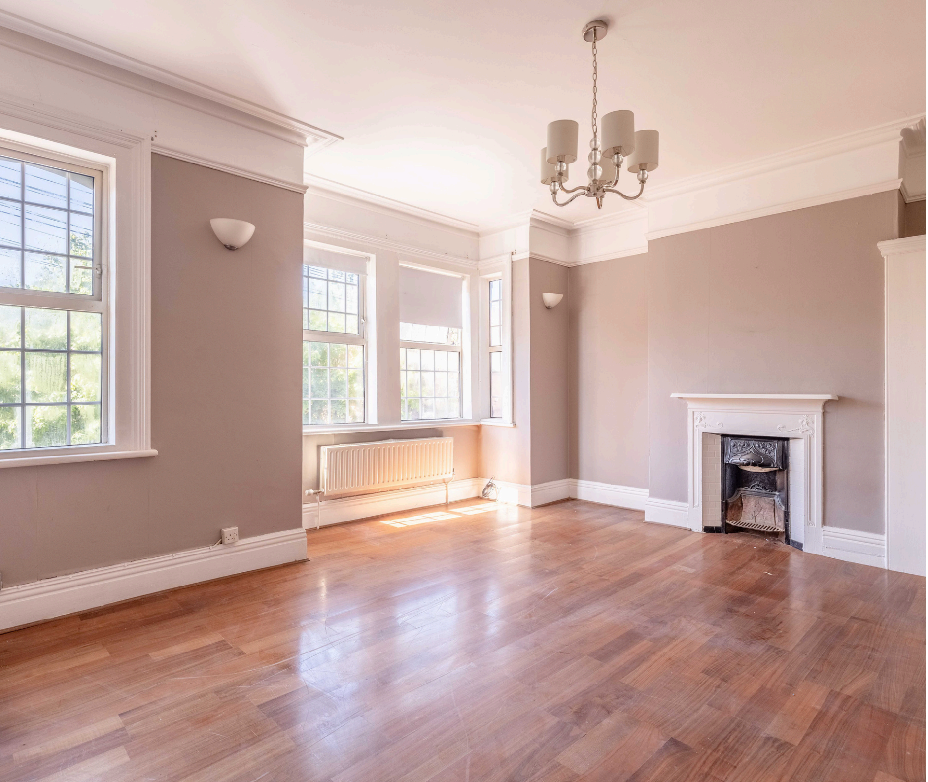
1A QUEENS ROAD, WINDSOR