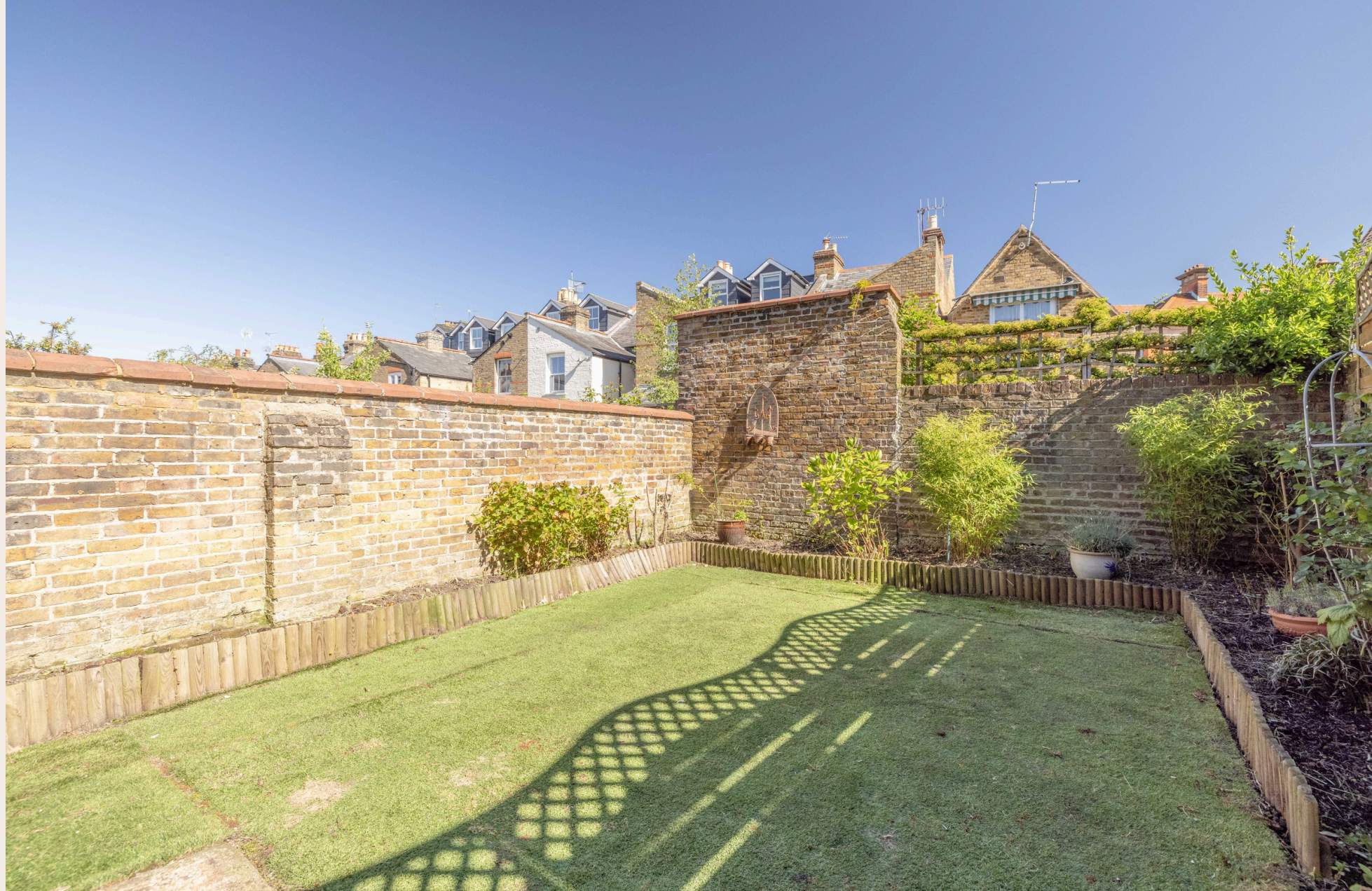
1A QUEENS ROAD, WINDSOR