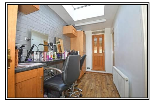
<u>STUDIO</u> 13'1 x 6'1 Flooded with natural light from the sky light. Fitted with light oak units and workstation, laminated wood effect flooring, radiator, light oak doors to cloakroom and garage. Part glazed door leading to the: