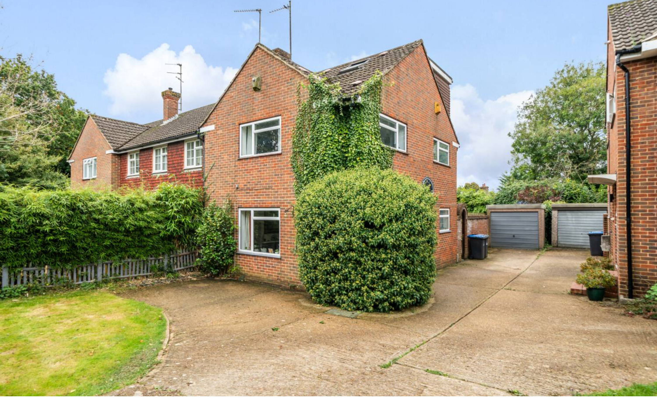
54 Newton Road, Lindfield Guide Price £535,000