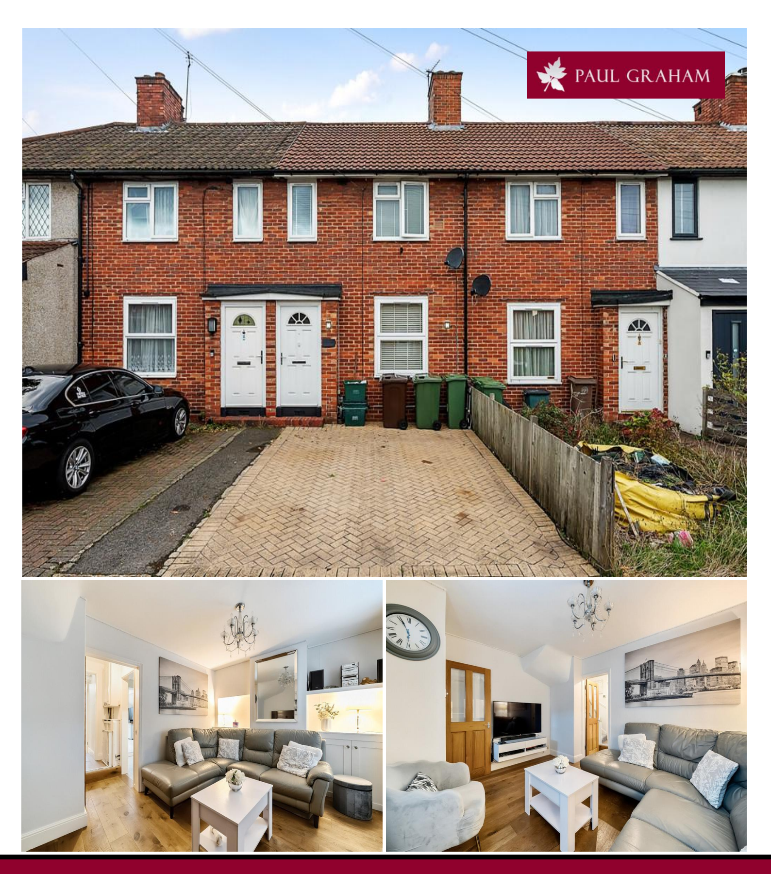
107 Waltham Road, Carshalton, SM5 1PS | £425,000 Freehold

This extended three-bedroom house, located in a desirable residential area of Carshalton, offers a blend of modern living and comfort. The ground floor features a welcoming front reception room and an impressive open-plan kitchen/diner, complete with a sleek, modern fitted kitchen. The property boasts a stylish bathroom, while the landscaped garden includes a versatile garden office/studio, perfect for home working or creative projects. With off-street parking, the house has been well-maintained and is presented in excellent condition throughout, offering plenty of space for family living.