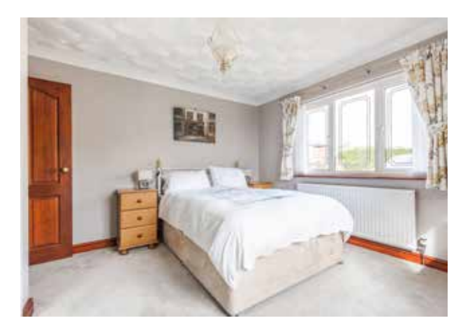
This remarkable fivebedroom bungalow offers an exceptional blend of comfort...