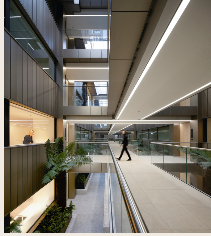
Marylebone Square, London W1