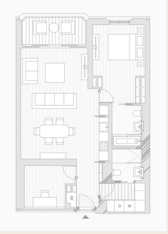
Tenure: 999 Years Service Charge: £9.50 to £10.50 per square foot per annum Parking available