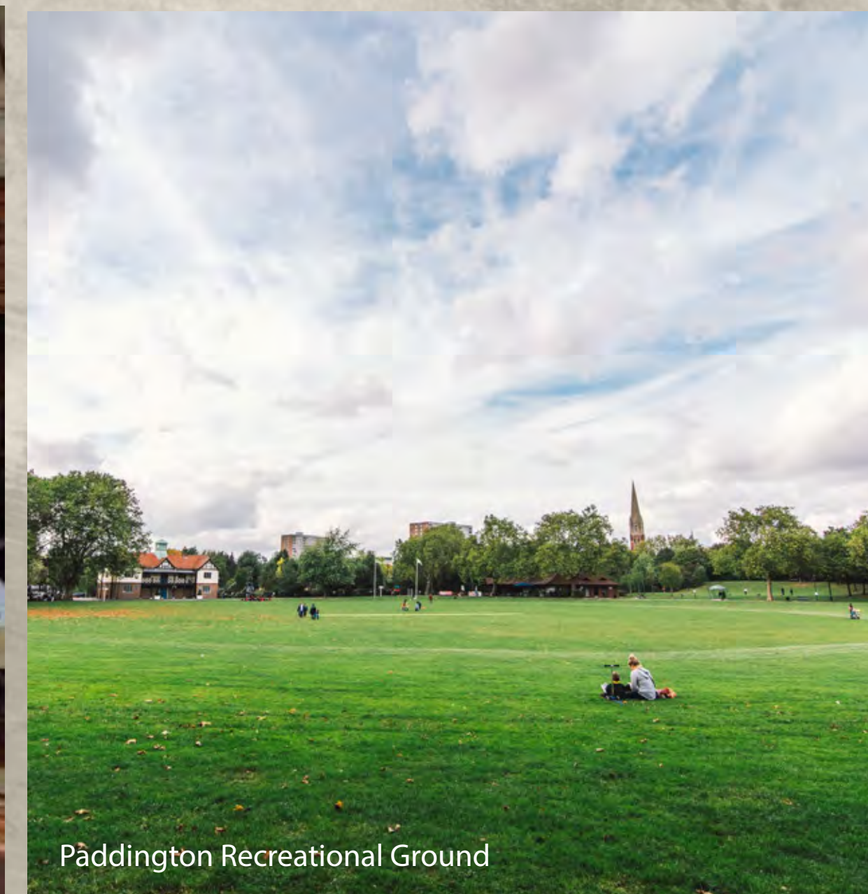
Paddington Recreational Ground