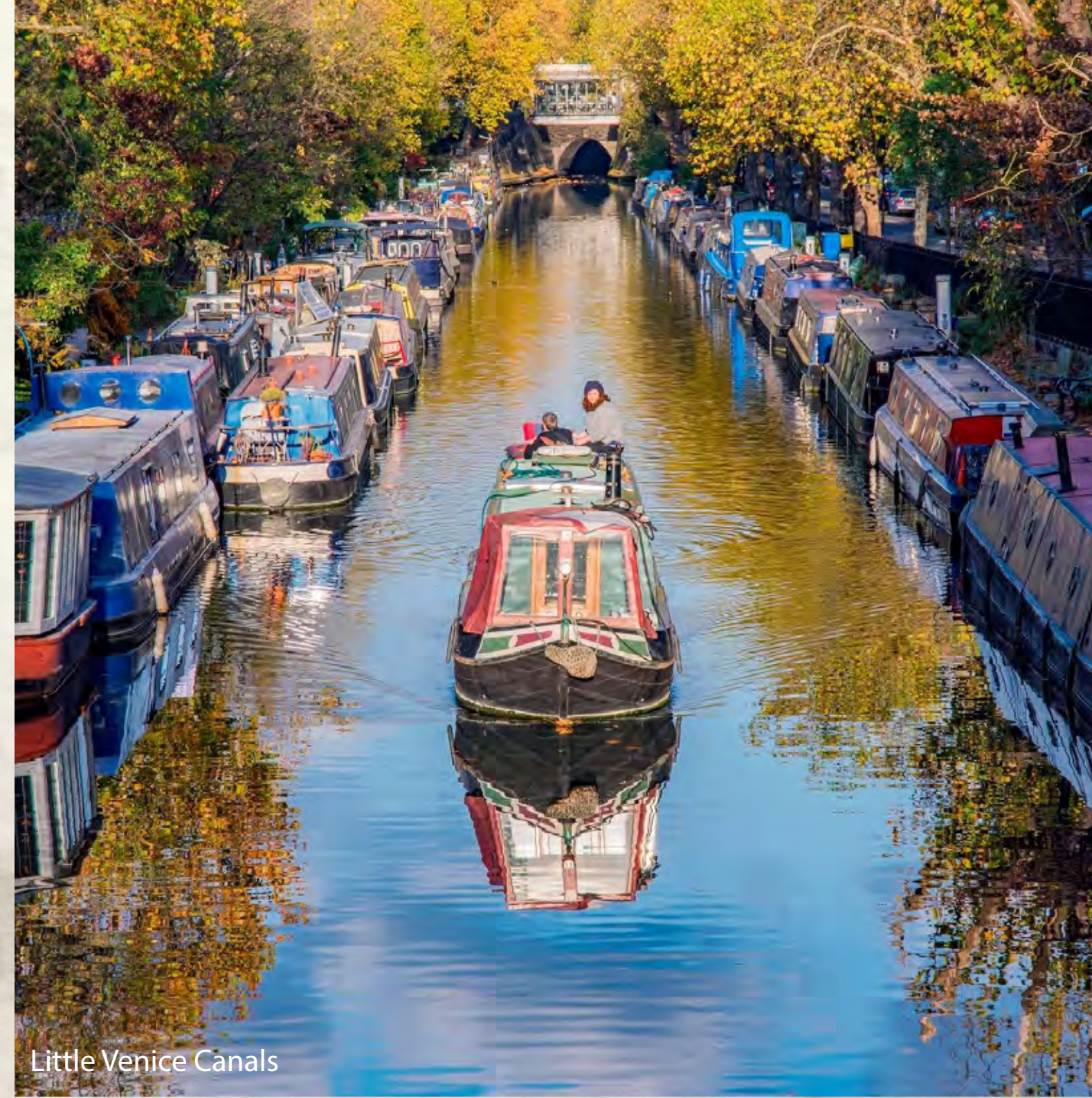
Little Venice Canals

The area is home to a variety of popular cafés and restaurants, including The Waterway and Cafe Laville, offering stunning canal views, as well as neighbourhood favourites like The Elgin and Banana Tree. These destinations provide excellent options for dining, meetings, or casual breaks.