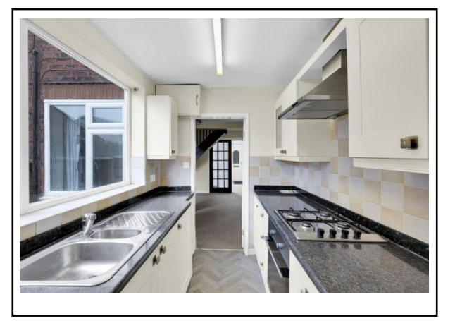
330 Booth Lane, Middlewich, CW10 0HA £140,000 – No onward chain

Offered for sale with no onward chain is this end terraced home. With accommodation comprising of two reception rooms, kitchen and bathroom to the ground floor. Whilst upstairs are three bedrooms. Externally is an enclosed rear yard with brick built storage shed. Viewing is advised to fully appreciate.