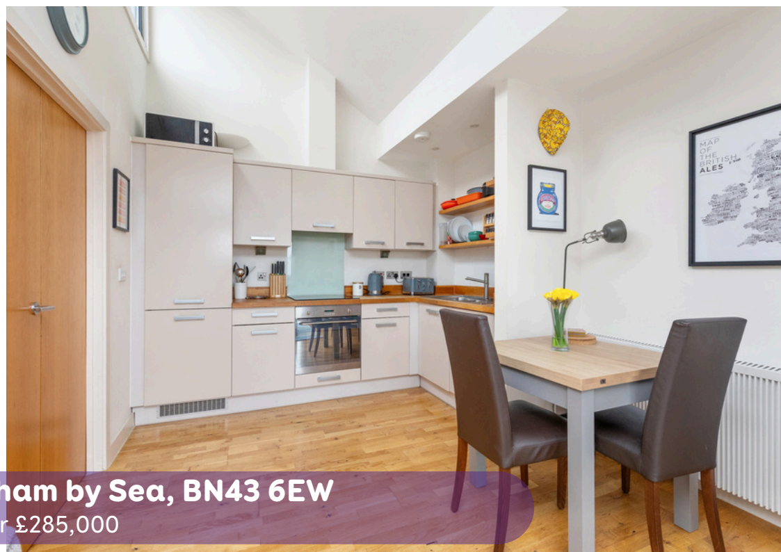
Mercury House, Shoreham by Sea, BN43 6EW Offers Over £285,000