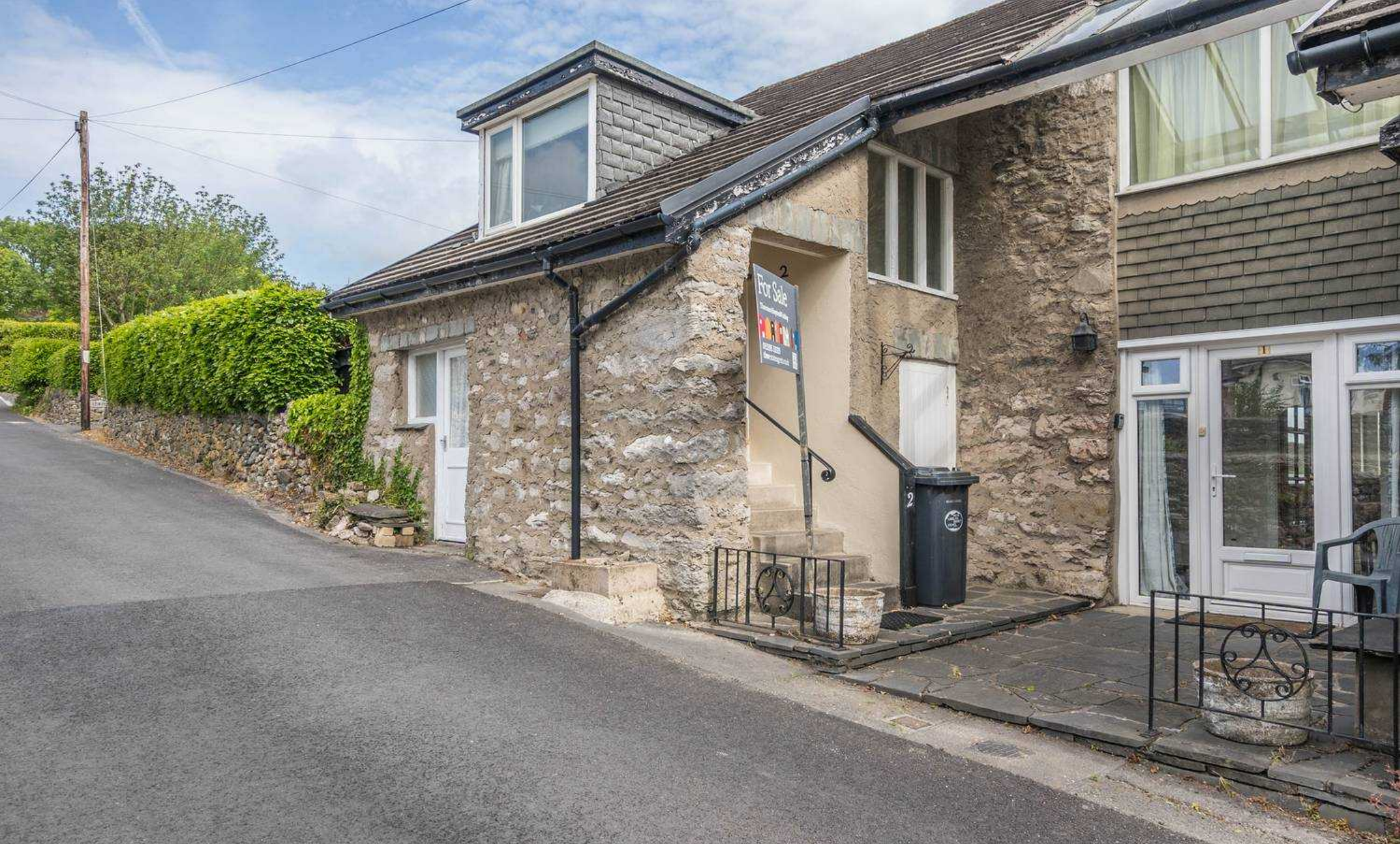
2 Yew Tree Court Cart Lane, Grange-Over-Sands £210,000