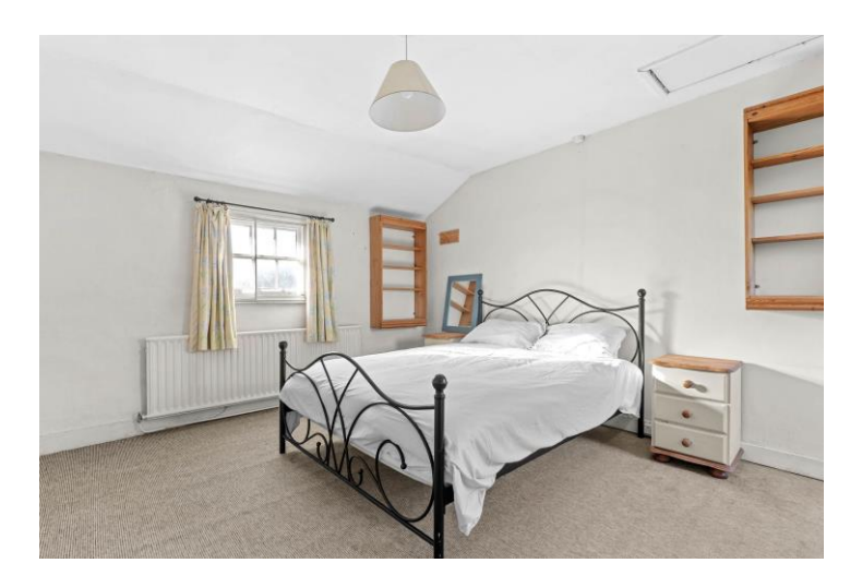
Bedroom Two 5.52m (18'1") x 3.64m (11'11")