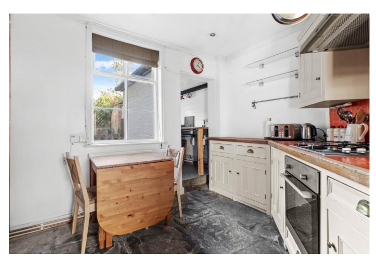
Utility Area 1.97m (6'5") x 1.38m (4'6")